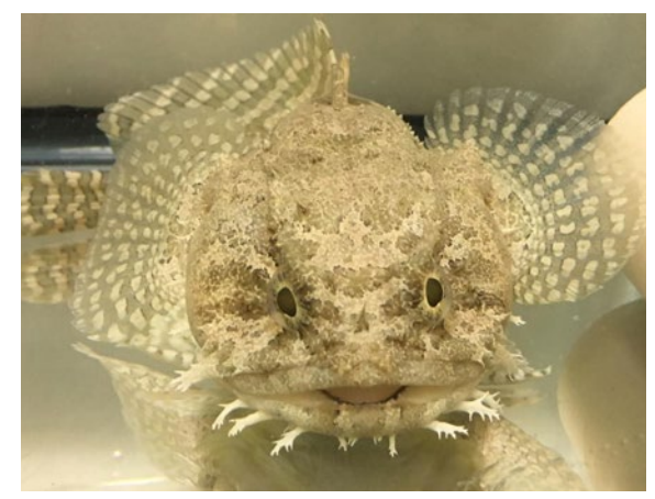
Photo Caption: A Gulf toadfish.

Toadfish, like other fish, have a similar stress axis and the same main stress hormone, cortisol, as mammals. That in of itself is an interesting thing because not all animals use cortisol as their stress hormone. Fish, dolphins, and humans do but rats, for example, use something called corticosterone. Another reason why we thought that toadfish would make a good comparison species for bottlenose dolphins was because they have a very pronounced stress response. Toadfish secrete cortisol at levels that are at least twice as high as other fish and many times higher than dolphins. We believed that this pronounced response would allow for an enhanced sensitivity when looking for disturbances in the function of the stress axis.