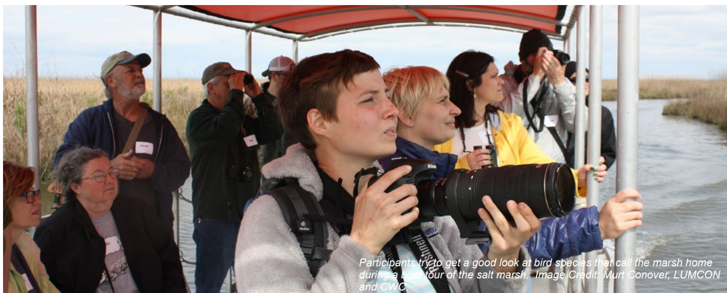
Participants try to get a good look at bird species that call the marsh home during a boat tour of the salt marsh.